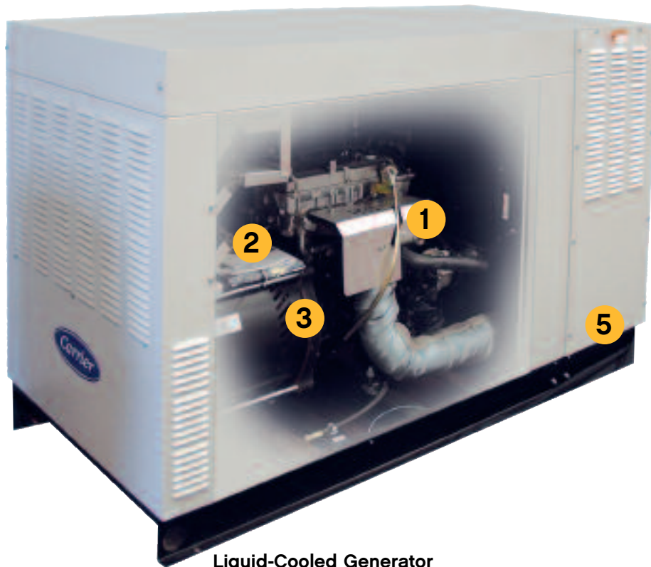
Liquid-Cooled Generator 25kW-45kW Output