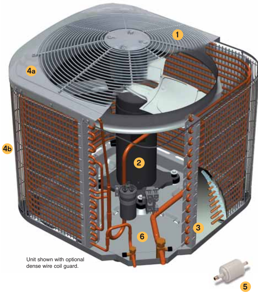
Unit shown with optional dense wire coil guard.