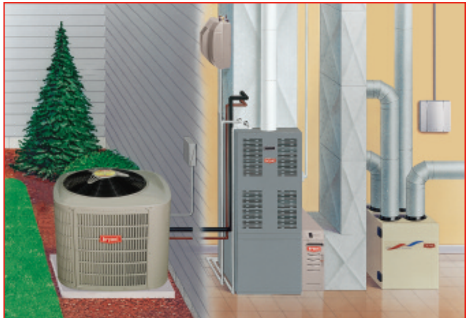
Air Conditioner and Oil Furnace System