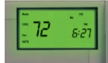
Easy-to-read LCD Display lights up for accurate readings at a glance, even under low light conditions.