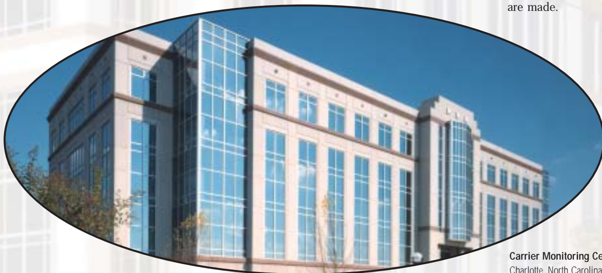
Carrier Monitoring Center, Charlotte, North Carolina

The CMC provides ongoing data analysis, enabling immediate response to alerts and alarm conditions. When possible, remote corrections are made.