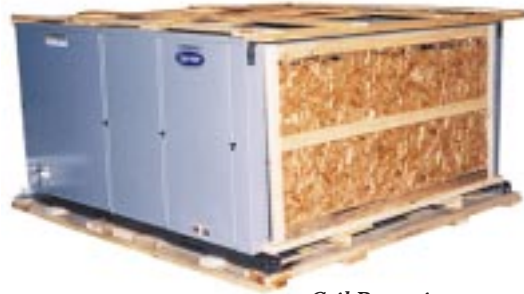
Coil Protection — standard on all units.

Extended Warranty Plans available for up to five years.