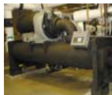
Installation of Carrier 19XRV Water-Cooled Chiller

Learn more about Evergreen® water-cooled chillers or download the complete case study.