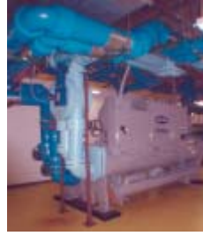
Installation of Carrier 23XRV Water-Cooled Chiller

Learn more about Evergreen® water-cooled chillers or download the complete case study.